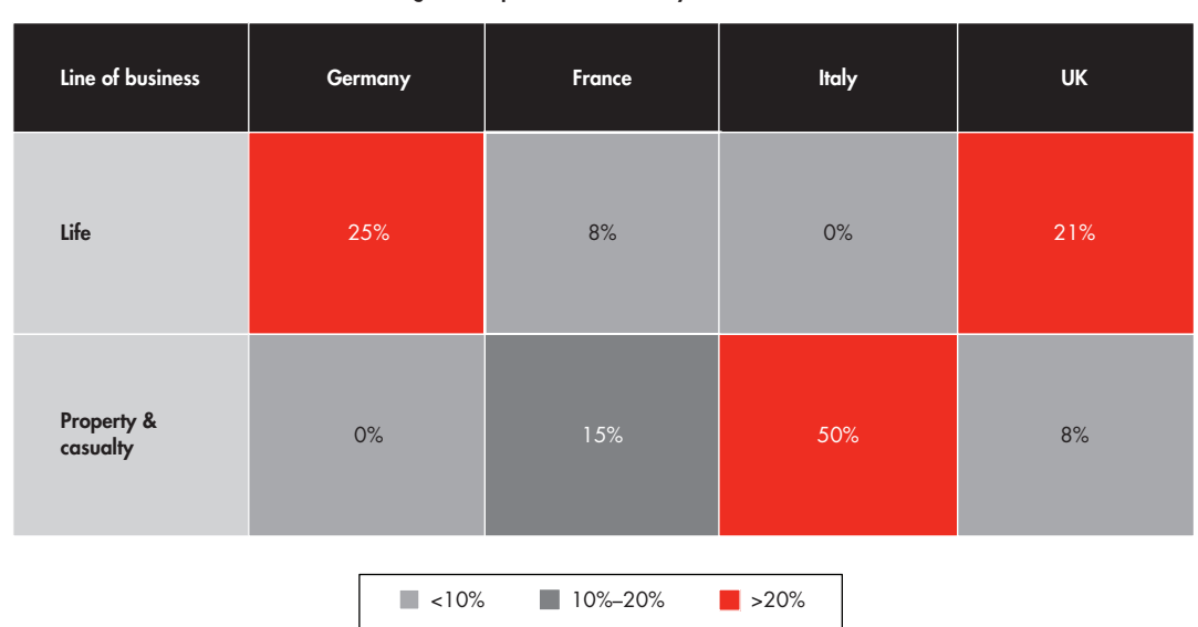
Percentage of companies with Solvency II ratio below 100%

Figure 1: Solvency II is expected to hit hardest with life insurers in Germany and the UK and with property & casualty insurers in Italy