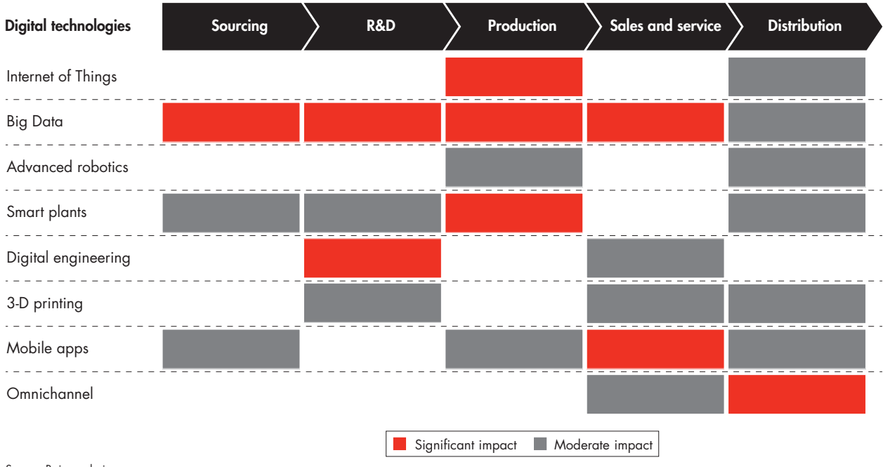
Figure 2: Digital trends affect the chemicals industry across the value chain

Some chemical companies are already using digital technologies in creative ways to improve salesforce effectiveness. One lubricant producer that equipped its salesforce with computer tablets found that this not only improved the quality of sales presentations but, more important, it also enabled it to collect data on how the salesforce was spending time with customers. It then used this information to fine tune its customer segmentation and provide better coaching to individual salespeople.